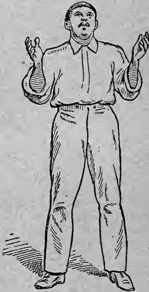
THE BAD CATCH.

to projectiles thrown from a railway-carriage window. Now, the pace of the run up to the crease before the ball leaves the hand is of small importance; the difference depends on the ball being propelled by a body in fast motion or by one hardly moving at all. So you can run fast up to the crease, and, just at the moment of bowl-